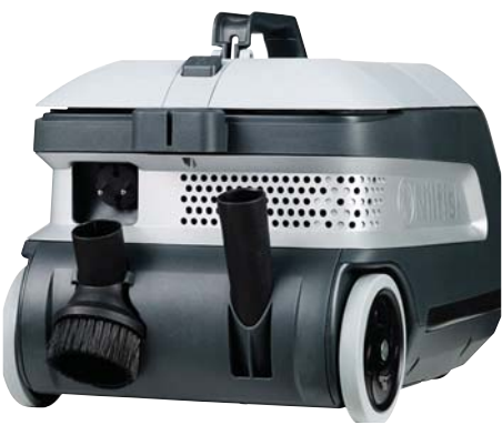
User friendly and easy to reach accessories