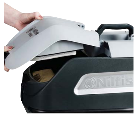
Magnetic hinges securing high reliability